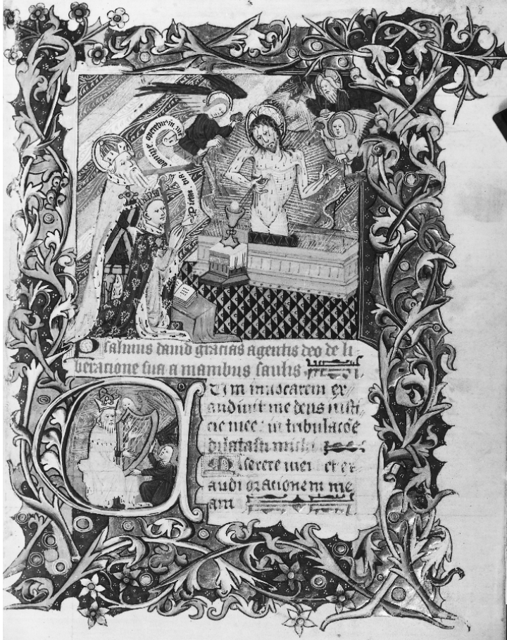
Fig. 2. Duke Humphrey kneeling before Christ as Man of Sorrows.